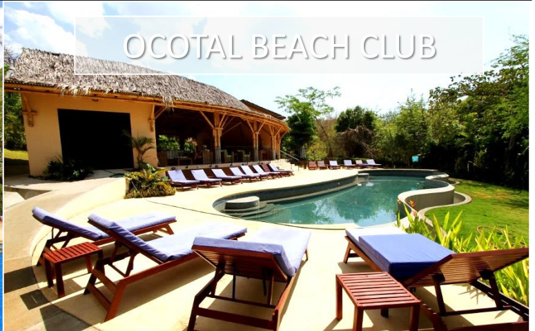
OCOTAL BEACH CLUB