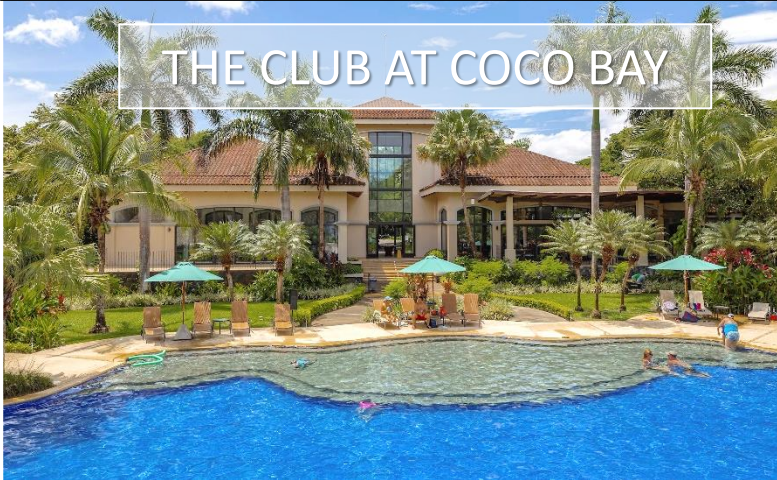
THE CLUB AT COCO BAY

CASA AGUILA COCO BAY ESTATES LOT 20 – 4 Bed, 3.5 Bath, Pool, Terraces, Carport, 3,335 Total SF - $1,250,000