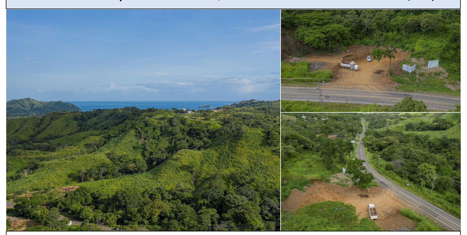
Dynamic 5.4 Hectare Development Parcel with Potential for Ocean View Lots and Commercial Road Frontage. This impressive 5.4 Hectare development parcel is located inside the upscale gated community of Ladera del Mar and offers impressive ocean and valley views overlooking Playas del Coco. You will get direct access to the property through the existing road structure of the Ladera del Mar project. There is the potential to carve out 5 ocean view home sites, creating an ideal project for a small, yet exclusive development. As a bonus, there is a large usable portion of the development parcel that has over 200 lineal meters of direct road front access on the main public highway (Route 151) leading into Playas del Coco. This portion of the property is suitable for a mixed use commercial development and enjoys heavy vehicle traffic providing the utmost visibility for any commercial or retail operation. The ocean view portion of the property will be part of Ladera del Mar, an upscale Gated Community with a beautiful private entrance complete with a welcoming reception center. All the internal roads of Ladera del Mar are paved and wind through a park like setting with mature trees, tropical landscaping and abundant flora and fauna. The property is 25 minutes to the Guanacaste International Airport (LIR) and only 10 minutes to the town center of Playas del Coco where you enjoy all the watersports, shopping, restaurants, nightlife, healthcare, and services of the famed Papagayo area.