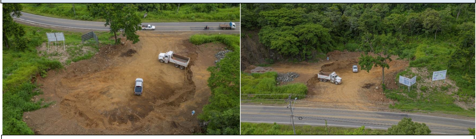
Included is a 5.9 Hectare Development Parcel that has an ocean view portion that can be split into 5 ocean view lots. Also, the road front portion of the property has a large and flat area ideal for a commercial project fronting the main road leading into Playas del Coco.