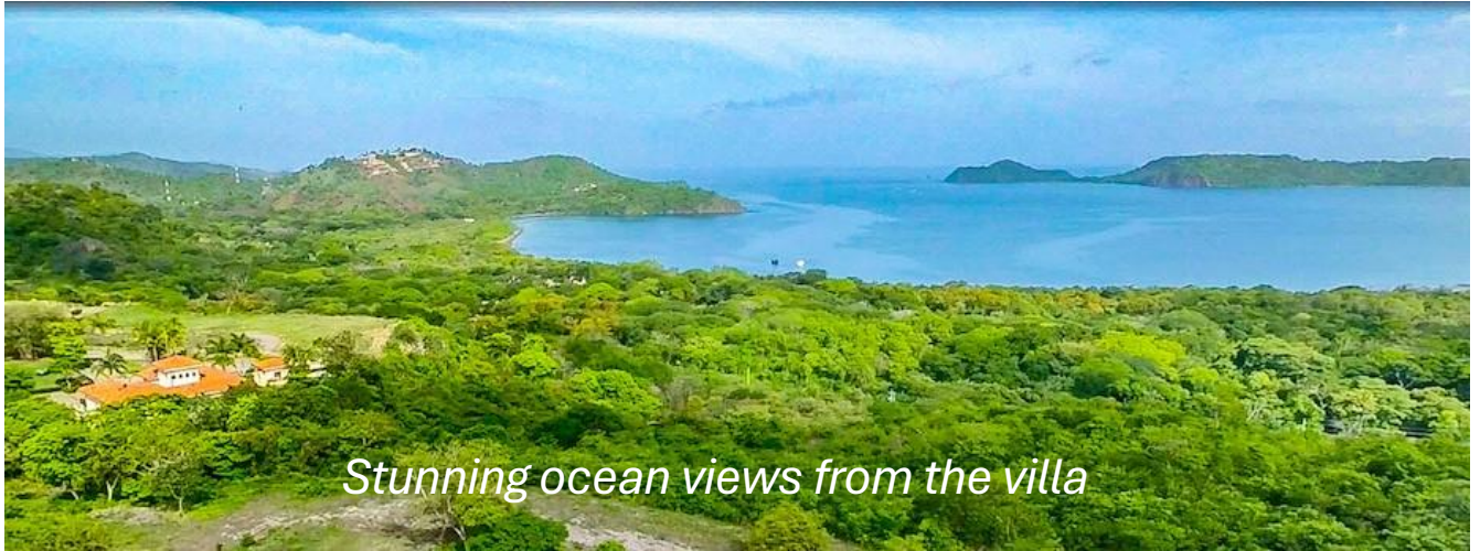
Stunning ocean views from the villa