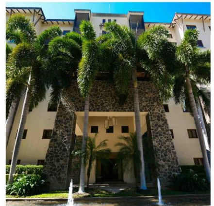
Less than 25 min. from Airport