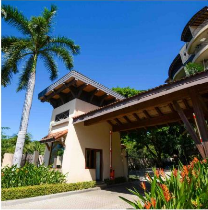
24/7 Gated Security