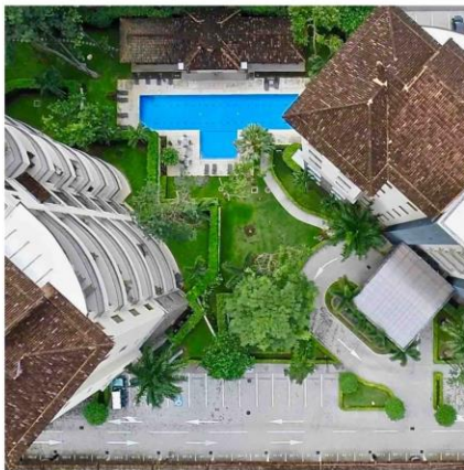
Covered assigned Parking