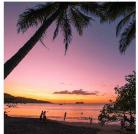
Storage Bodega for each unit

The Hermosa del Mar luxury condo is located in the prestigious Playa Hermosa area. Wake up in the morning listening to the gentle waves rolling into the beautiful beach which is only a short 2 minute walk away. Other amenities include; 24 hour gated security, secure covered parking, storage bodega, two common pools, fitness center, meticulously manicured gardens and common areas and dual elevators in each 7 story building. Ideally located less than 30 minutes to the Liberia Airport, 15 minutes to the CIMA Hospital, mere minutes to the services, restaurants, nightlife and watersports of the area or 10 minutes to Playas del Coco. With only a total of 40 units you too can be one of the privileged owners of Hermosa del Mar.