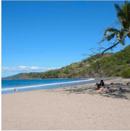
2 min. walk to beach