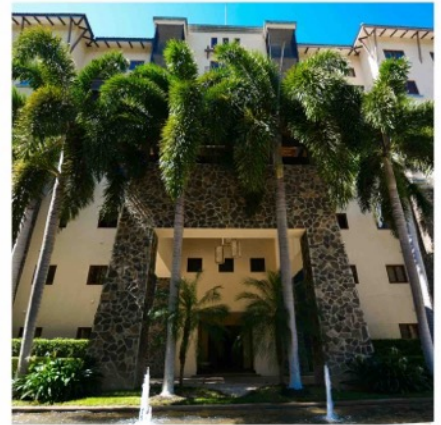
Less than 25 min. from Airport