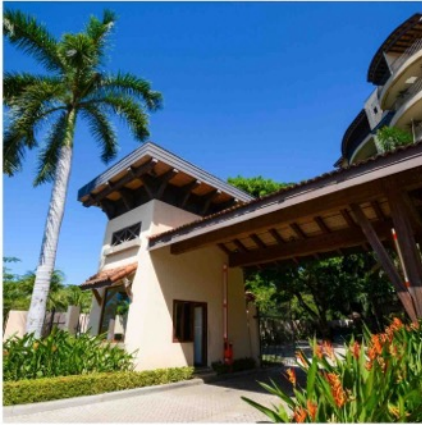
24/7 Gated Security