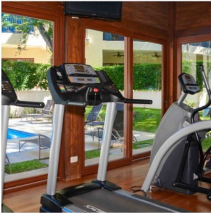
Fully equipped Fitness Center