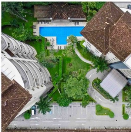
Covered assigned Parking