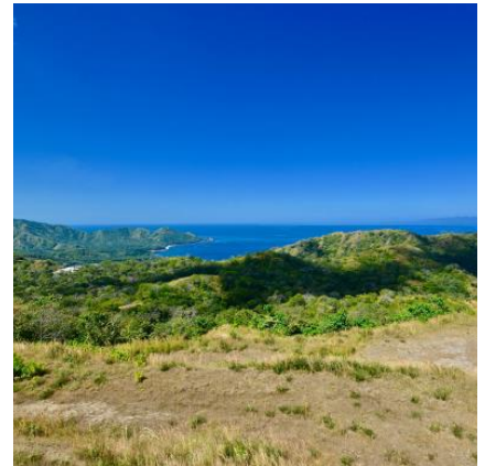
Min. 1.25 acre Estate Lots