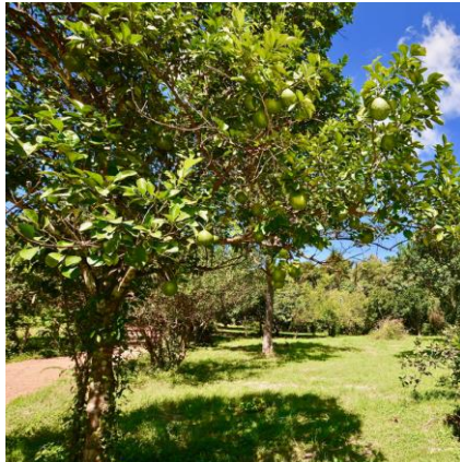
Citrus Fruit Orchard