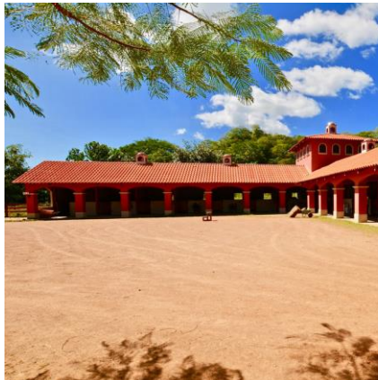
14 Stalls + Tack Room