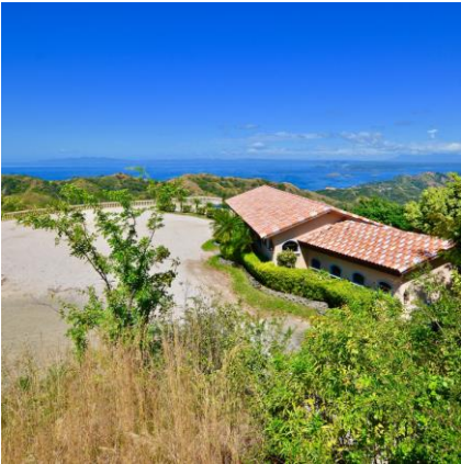
Stunning Ocean Views