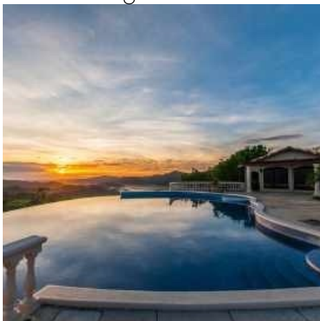
Sunrise at Owner's Lounge