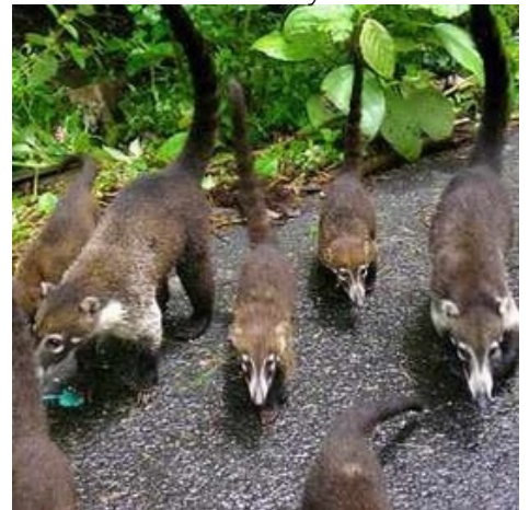
Wildlife abounds at Lomas