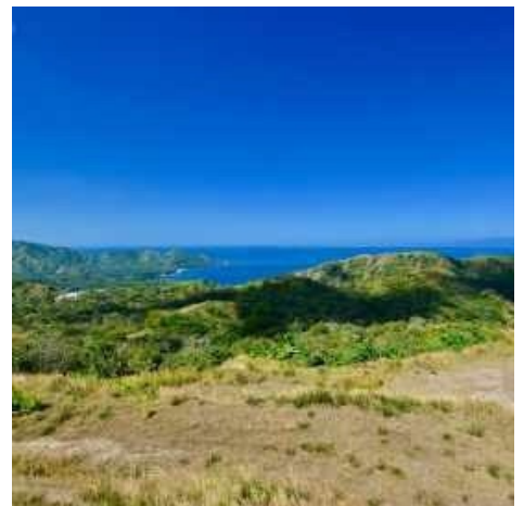
Min. 1.25 acre Estate Lots