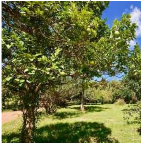
Citrus Fruit Orchard