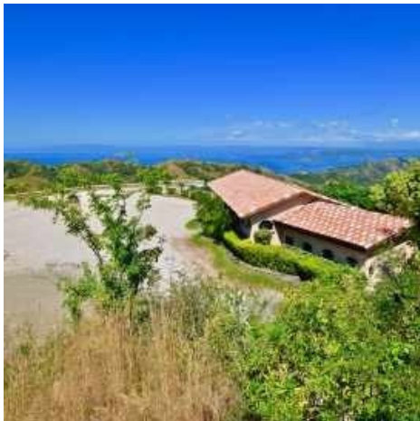
Stunning Ocean Views