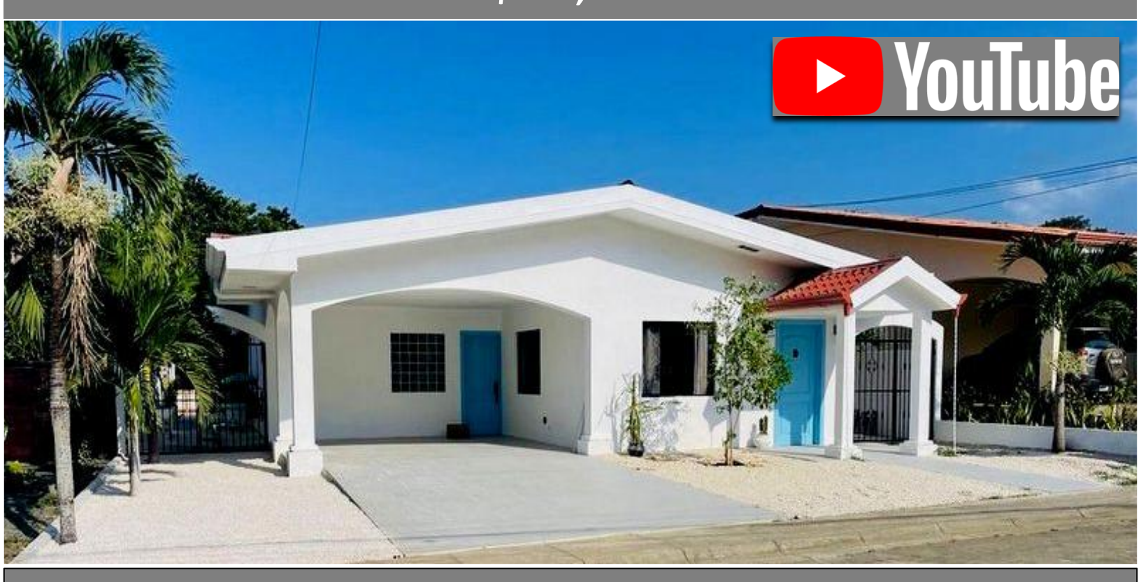
Mossey Rock #3-3 Bedroom-3 Bath-Total 1630 Sq/ft-Fully Renovated-Playas del Coco-$449,000

3 Bedrooms-3 Bathrooms-Total 1630 Sq/ft-Fully Renovated-Furnished Playas del Coco-Costa Rica $449,000