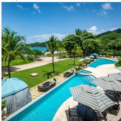
2 pools & private Cabanas