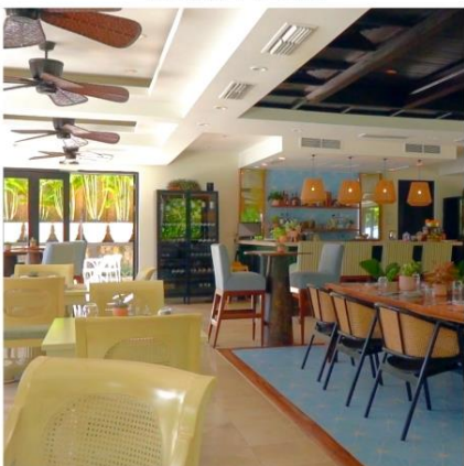
Dining room at Beach Club