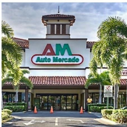
Supermarket & Retail Shops