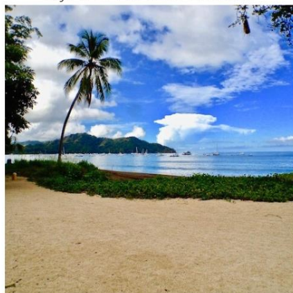
Free shuttle to Beach Club