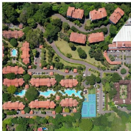
4 Pools & Sports Complex