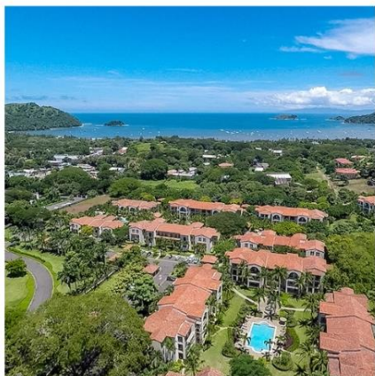
Walk to the beach!