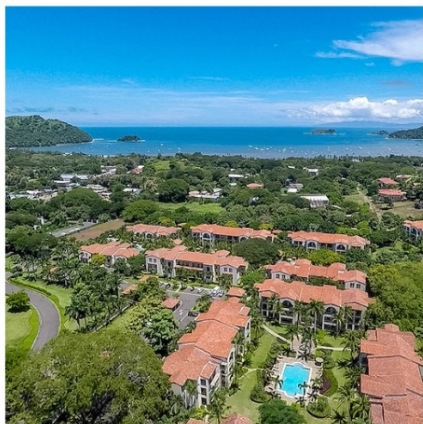
Walk to the beach!