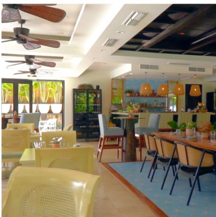
Dining room at Beach Club