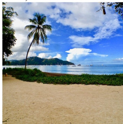
Free shuttle to Beach Club