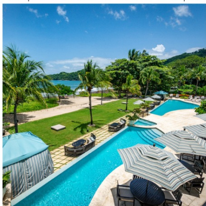
2 pools & private Cabanas