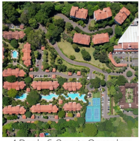
4 Pools & Sports Complex