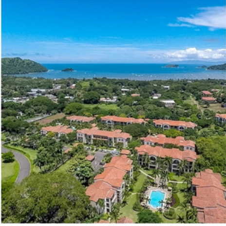
Walk to the beach!