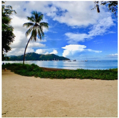
Free shuttle to Beach Club