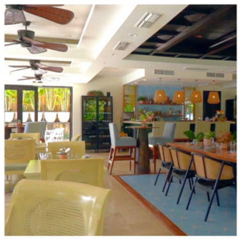
Dining room at Beach Club