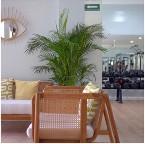
Gym & Fitness Center