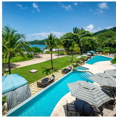
2 pools & private Cabanas