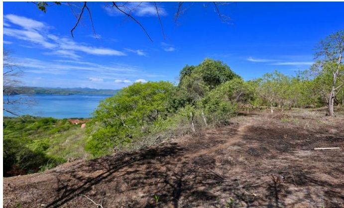
Flat building area at highest elevation