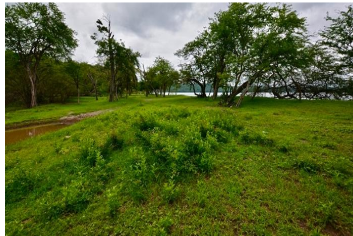
Beach access only 200m from property