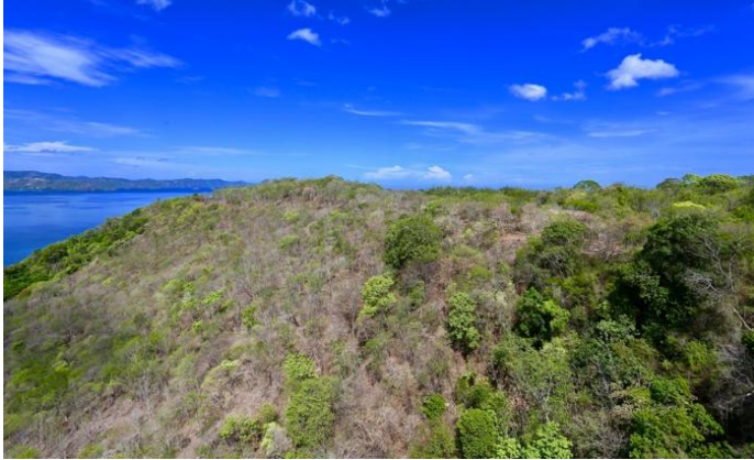
Sloped terrain ideal for terraced lots