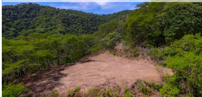
Lower Level Building Pad