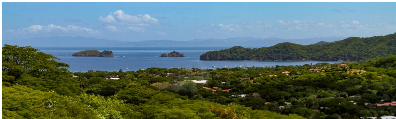
Top Level Building Pad